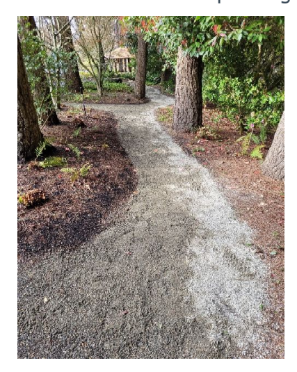
Fresh gravel on the paths

Some recent work in the gardens includes spreading fresh gravel on the paths in the fabulous fern garden, and a major clean-up of the area just to the east of the north parking lot.